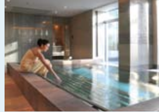
Far Left: Sunmeadow Left: The Six Senses Spa